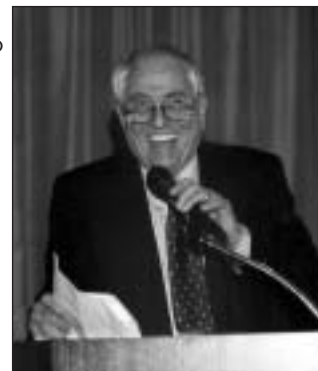
Master of Ceremonies, Garry Marshall, entertained all with his wit and style