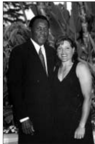
Olympians Rafer Johnson and Lisa Fernandez an honoree at gala event.

The evening raised approximately $275,000! On behalf of the abused, neglected and at-risk children served by Aviva, we thank all the volunteers, sponsors, and donors who made this year's Gala so successful.